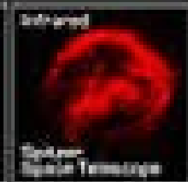
Kepler's Supernova Remnant - SN 1604